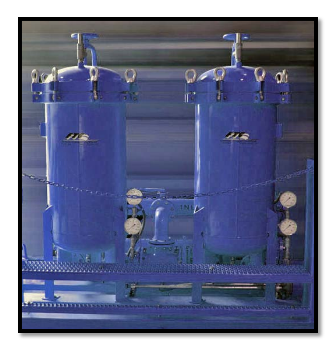
Model 4 Wastewater Cleanup System Shown with Offshore Packaging Options

Systems are optimized for weight, height, footprint, and ease of filter replacement. Larger capacity systems are available.